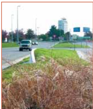
Oostema Boulevard is enhanced by new signage and over 650 deciduous, evergreen and flowering trees, 3,500 evergreen and deciduous shrubs and 10,000 perennials.

"The materials, colors and forms in the terminal remind you of the shore, sand dunes and water," says Evanoff. "We picked up this 'organic' feeling for the new signs and lighting."