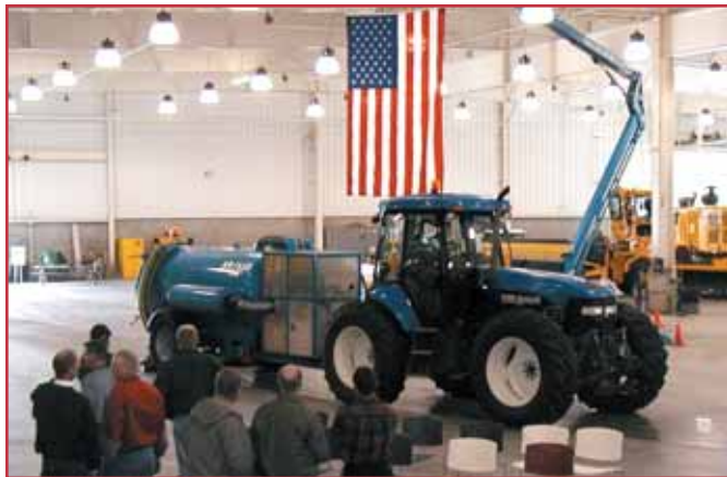
The Glycol vacuum truck demonstrates its capabilities to maintenance staff.

After lunch, GFIA’s maintenance team offered a special session on snow plowing procedures and ramp snow removal, followed by demonstrations of various equipment: runway de-icer truck, snow eliminator and Glycol vacuum truck. One of the Airport’s air traffic control tower supervisors spoke on snow removal communications,