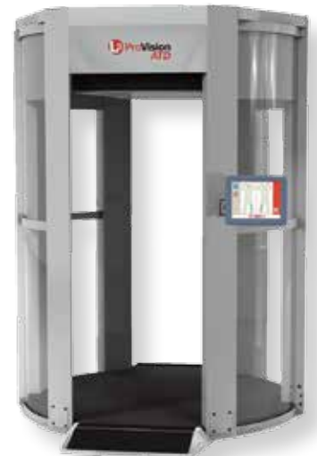
Millimeter wave technology machines similar to this L-3 model will soon be seen at GFIA.

Millimeter wave technology bounces harmless electromagnetic waves off the surface of the body to create the same generic image for all passengers. All millimeter wave technology units are equipped with Automated Target Recognition software that detects any metallic and non-metallic threats concealed under a passenger's clothing by displaying a generic outline of a person on a monitor attached to the AIT unit highlighting any areas that may require additional screening. The generic outline of a person will be identical for all passengers. If no anomalies are detected, an "OK" appears on the screen with no outline ( see image below ).