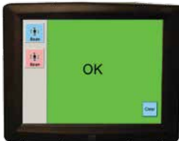
If no potential threat items are detected, an "OK" appears on the monitor with no outline.

AIT looks for metallic and non-metallic items that might be located anywhere on the body. Before you go through this technology, we strongly recommend removing ALL items from your pockets and certain accessories that you might be wearing, including your wallet, belt, bulky jewelry, money, keys, and cell phone. Removing all of these items will reduce your chances of needing additional screening after you exit the machine. To avoid the chance of leaving any of your personal items behind, TSA recommends that you place them in your carry-on bag prior to entering the checkpoint.