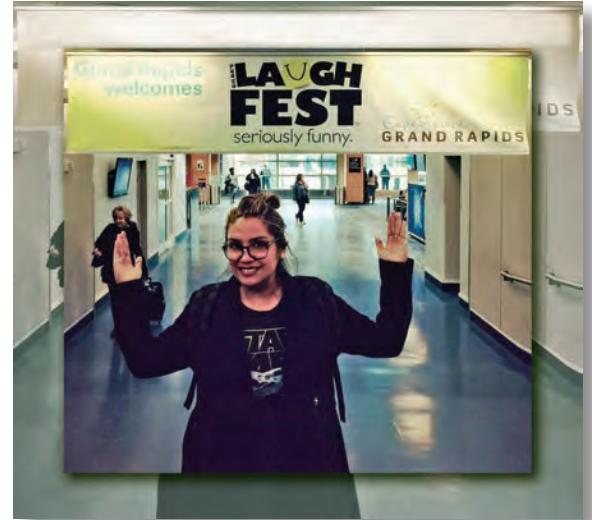
ABC’s Cristela Alonzo arrives at GFIA for LaughFest

Upon arrival in Grand Rapids, Alonzo tweeted a photo of herself at GFIA underneath the airport LaughFest banner.