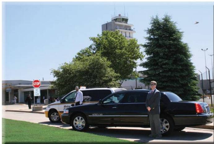
Drivers and vehicles stand at the ready to handle your ground transportation needs. Metro Cab's blended fleet offers airport patrons their choice of a traditional taxicab or a luxury sedan.

Metro Cab's philosophy is to provide the highest levels of customer service in the industry by providing new, well-maintained vehicles, driven by professional drivers and chauffeurs. To make a reservation, call (616) 827-6500.