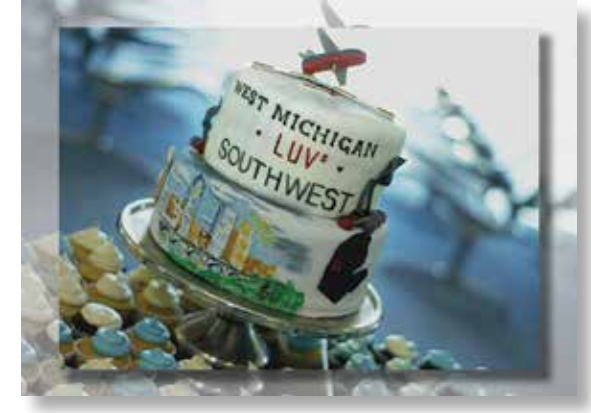
LUV doesn't get any sweeter than this beautiful and delicious cake created by the Cakabakery!

So, before you plan your next vacation or business trip, be sure check out Southwest Airline's fares only available at Southwest.com.