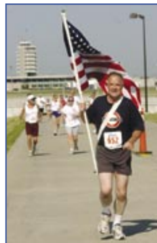
A participant shows his spirit during the Flyby 5K Run