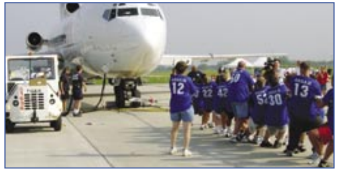
Special Olympics Michigan Area 11 team pulls the FedEx B-727