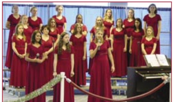
Caledonia High School Women's Choir performs during the Holiday Music Festival