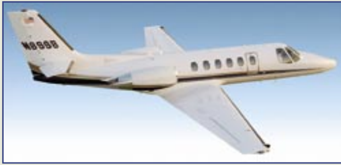
The Company Jet's fractional programs feature the use of Cessna Citation Bravos

Founded in 2002, The Company Jet, based at GFIA, offers fractional jet ownership programs designed specifically for business by business travel experts.