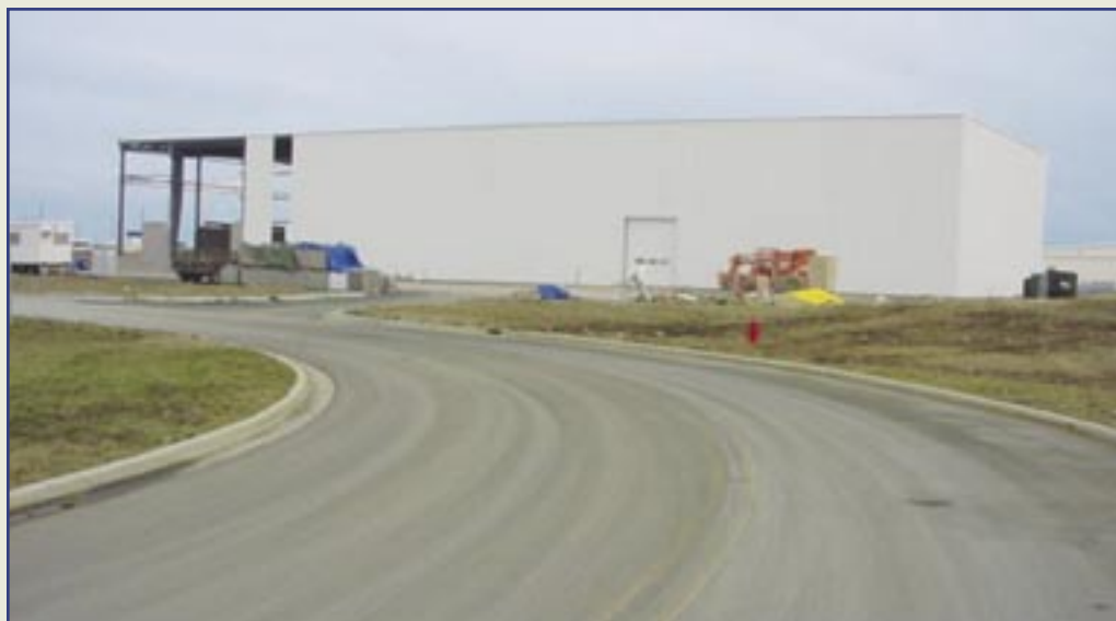
Phase I of the project will include a restoration hangar and educational facility

initial construction that has occurred is one visible sign of our progress, but there are many other things going on, too. Thanks to our Web site, www.mmals.org , even without the building we have a virtual museum." →