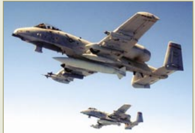
A-10-A Thunderbolts utilize the runways at GFIA periodically for training

Among our frequent guests at GFIA are the brave women and men who serve with the Air National Guard and the Air Force Reserve. Both the 110th Fighter Wing of the Air National Guard, based in Battle Creek, and the 927th Air Refueling Wing of the Air Force Reserve in Mt. Clemens, use the Airport as one of their training sites. Last year alone, GFIA hosted thousands of training runs for pilots flying the A-10-A Thunderbolt and the KC-135E Stratotanker.