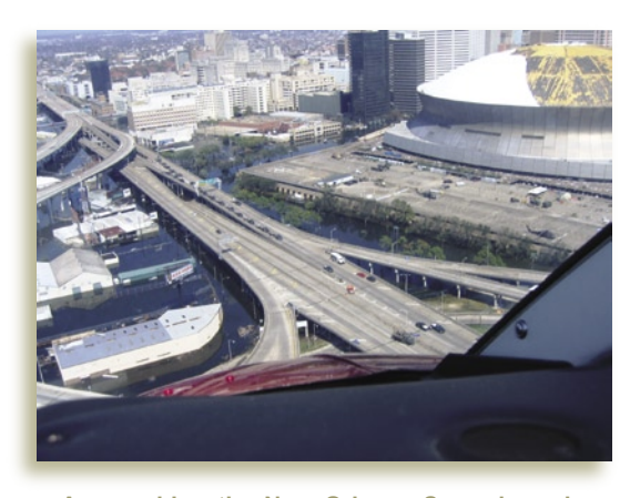
Approaching the New Orleans Superdome in the aftermath of Hurricane Katrina.

took such pride in being able to help the relief efforts in this manner. I had pilots volunteering for every flight we took and they were genuinely disappointed when our help was no longer needed." Northern Jet Management provided significantly discounted flights of several of their corporate aircraft. Aero Med provided helicopter maintenance supplies and medications. Wings of Mercy has, to date, provided more than a half dozen medical relief flights.