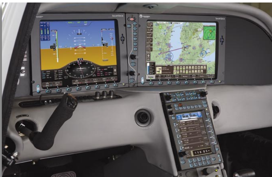
The SmartDeck® Integrated Flight Controls & Display System installed in the cockpit of a Cirrus SR22.

L-3 Avionics Systems employs more than 500 people and is a division of L-3 Communications, which is the sixth largest defense company in the United States with 2006 sales totaling more than 12.4 billion dollars. L-3 is one more way in which GFIA connects with the global economy.