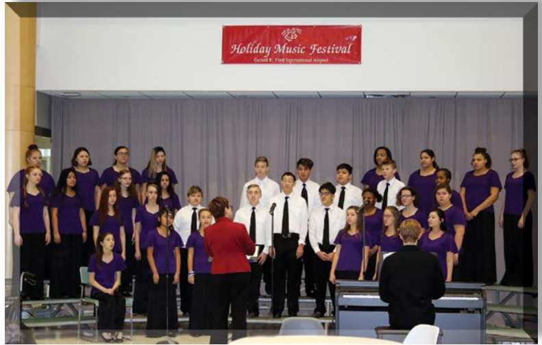
Wyoming Jr. High School Choir

Far from their ordinary venue, the directors and students thoroughly enjoy performing at the airport. One senior commented, "This has been my favorite off (school) campus location to perform at. The energy here is different than anywhere else we sing and it's just amazingly fun!"