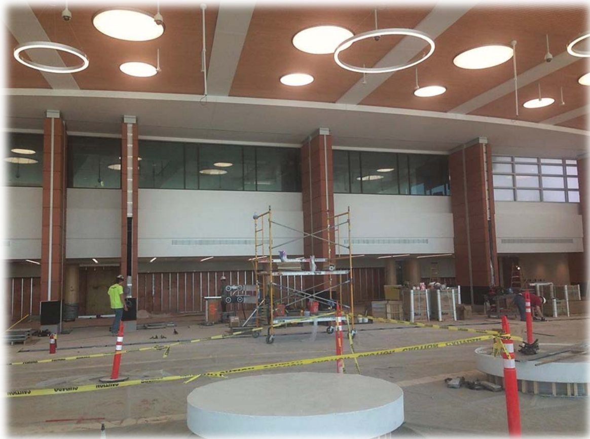
(Above): Construction crews work on the front entrance of the Gateway Transformation Project at the consolidated security checkpoint.

Grand Rapids, Mich. –Passengers traveling through the Gerald R. Ford International Airport (GFIA) this weekend will notice a change in security screening as one part of its Gateway Transformation Project transitions.