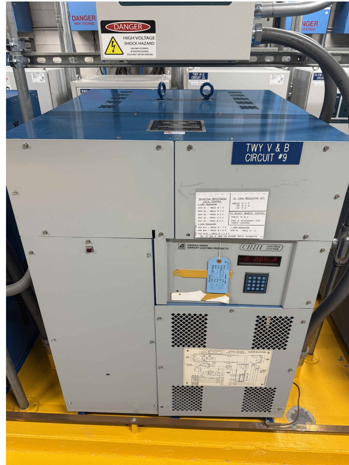
2 EXISTING TWY B - V&B REGULATOR E303 SCALE:N.T.S