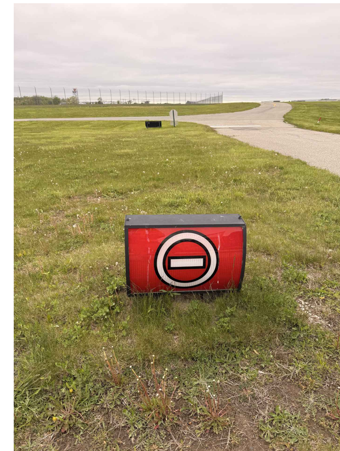
6 EXISTING GUIDANCE SIGN #426 E303 SCALE:N.T.S