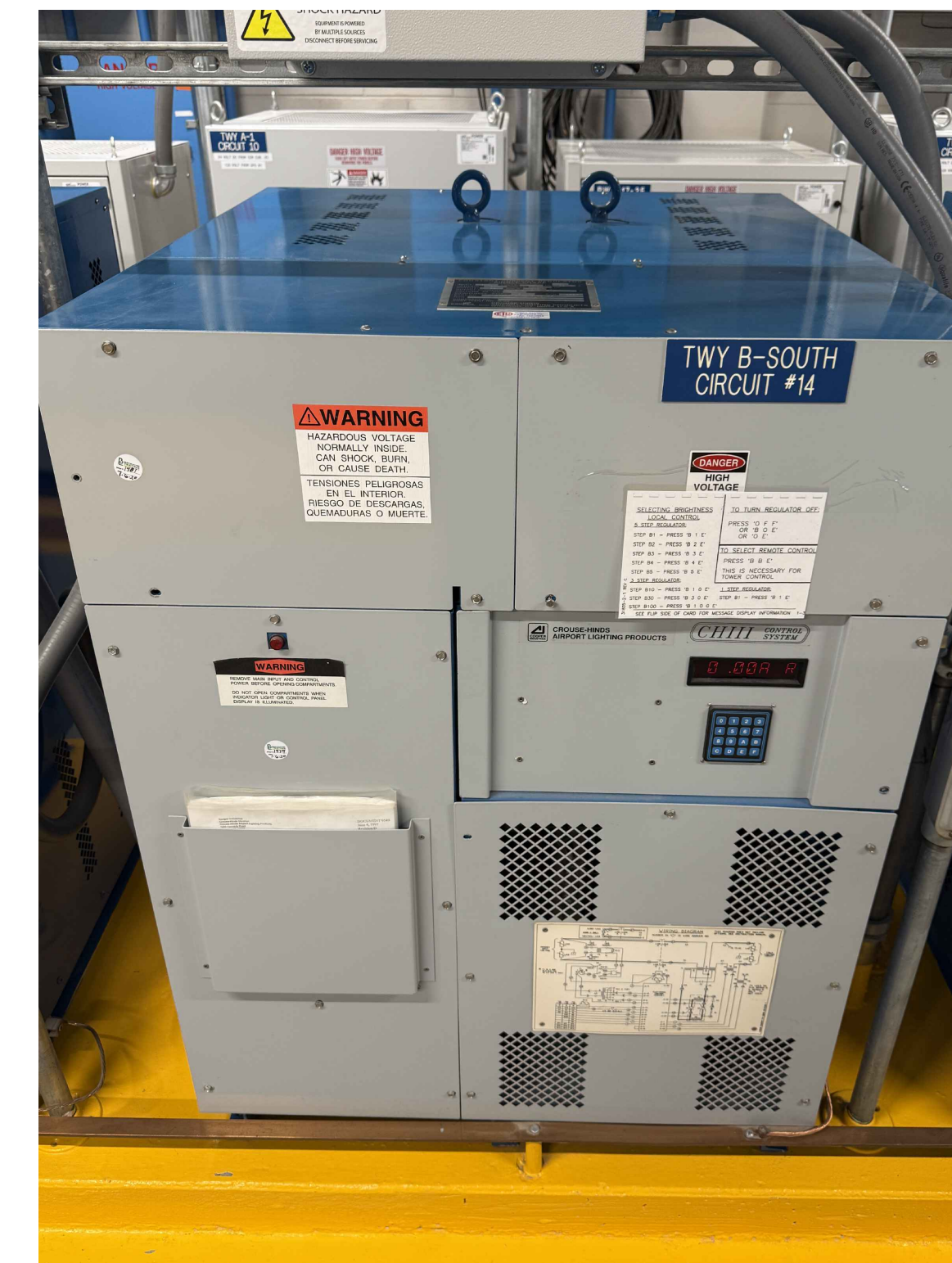
3 EXISTING TWY B - SOUTH REGULATOR E303 SCALE:N.T.S