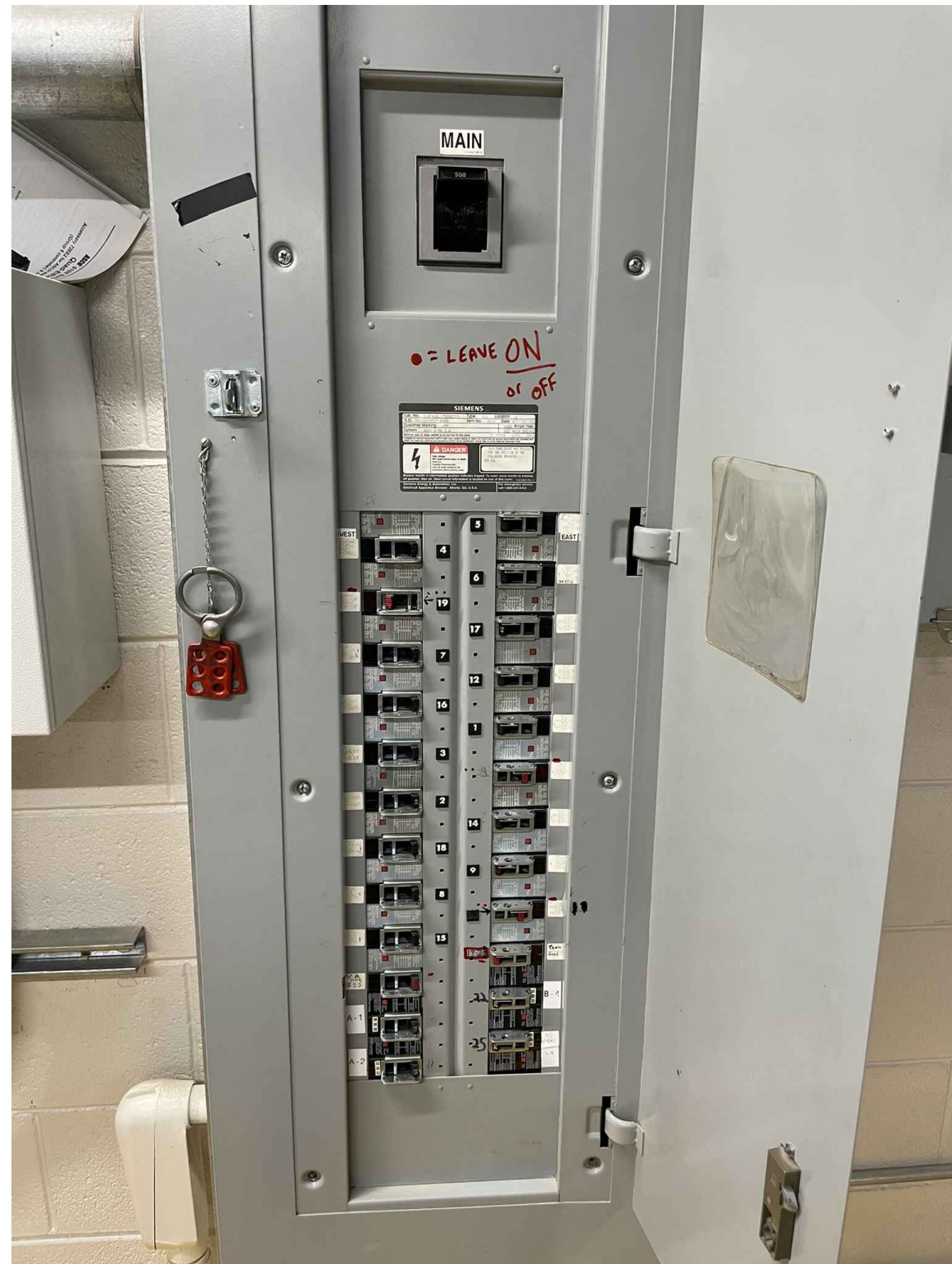
1 EXISTING PANEL "PP" E303 SCALE:N.T.S