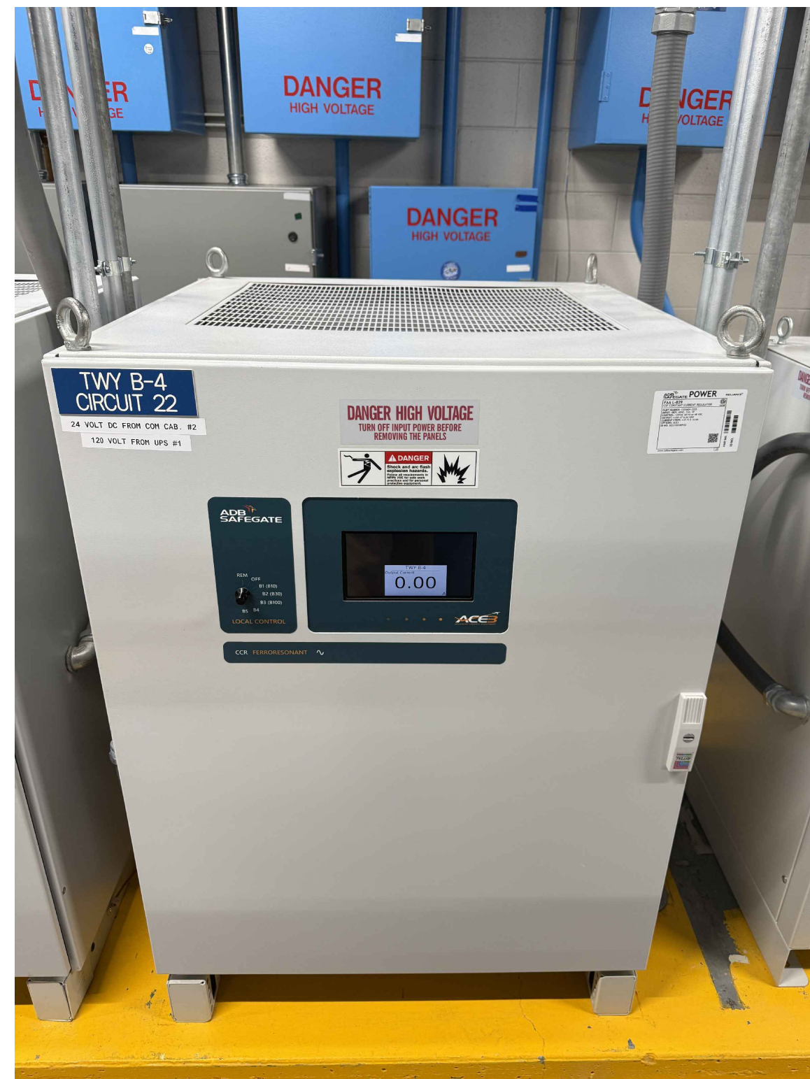
5 EXISTING TWY B - 4 REGULATOR E303 SCALE:N.T.S