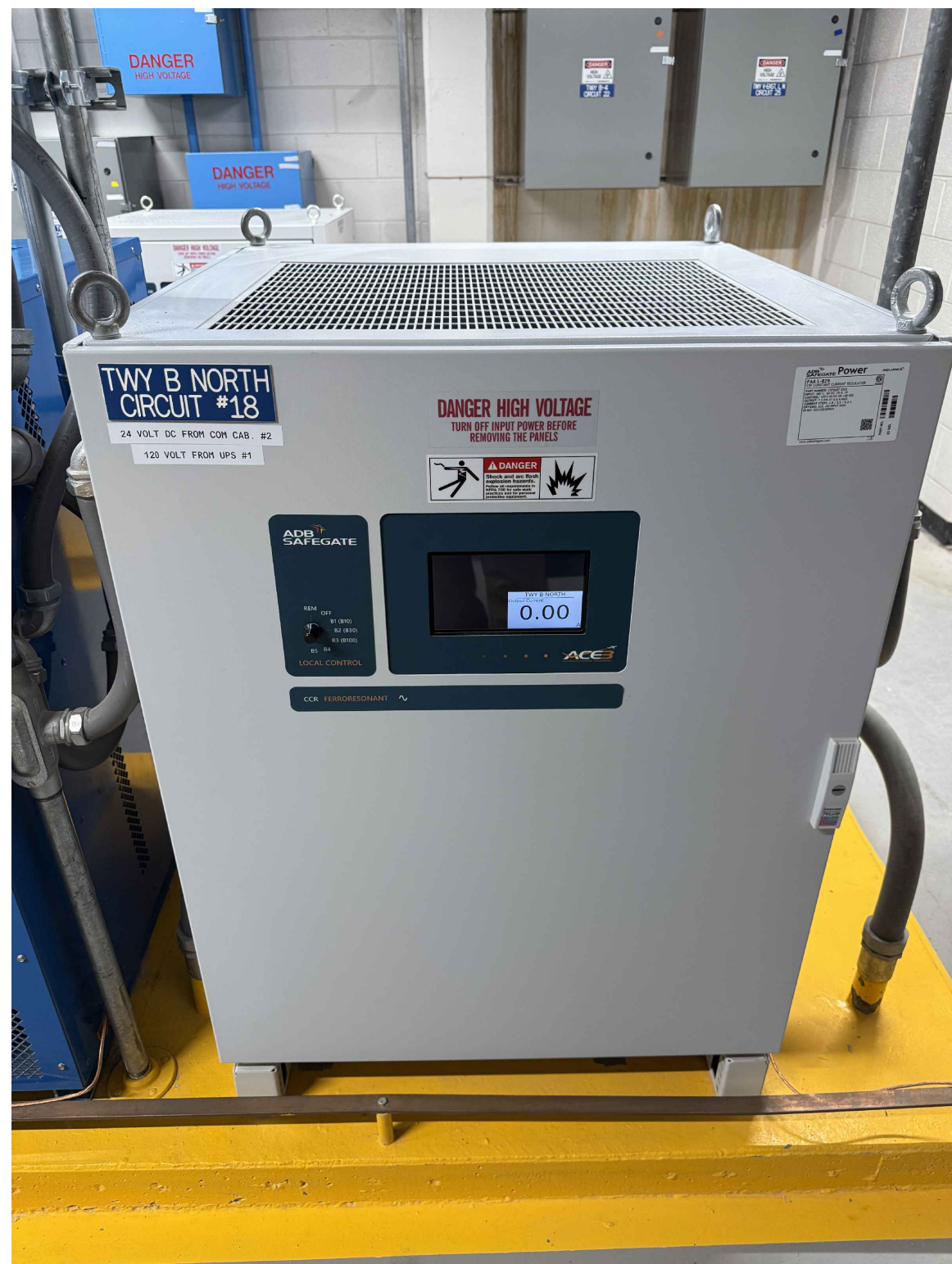
4 EXISTING TWY B - NORTH REGULATOR E303 SCALE:N.T.S