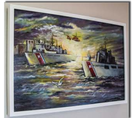
Semper Paratus - Always Ready Wanda Aikens