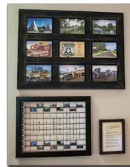
Are You a Route 66'er Gary Fouts