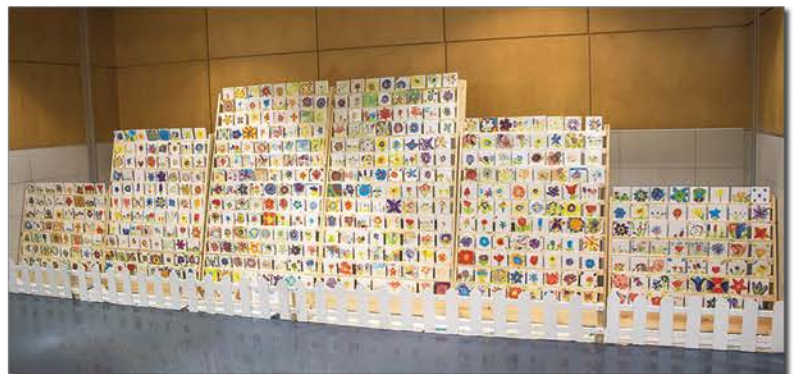
A Child's Garden | Tim Donohoe