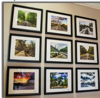
Path of Determination Billy Butski