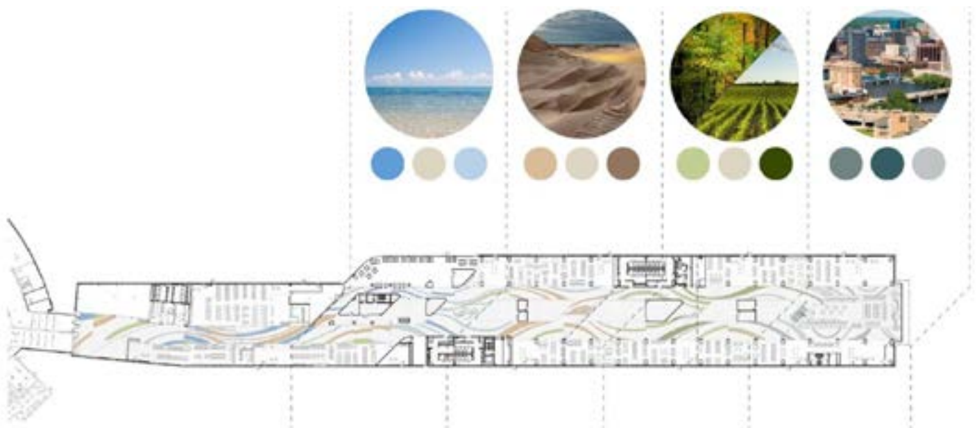
Concourse A Floor plan including themes and potential colors.

With the goal of creating a sense of place directly tied to West Michigan, the role of art in the Concourse A expansion project becomes an extremely important layer. Artists should aim to complement the physical and spacial context but also to encompasses and express the non-physical perception, diversity, and identity unique to Grand Rapids and the larger West Michigan community.