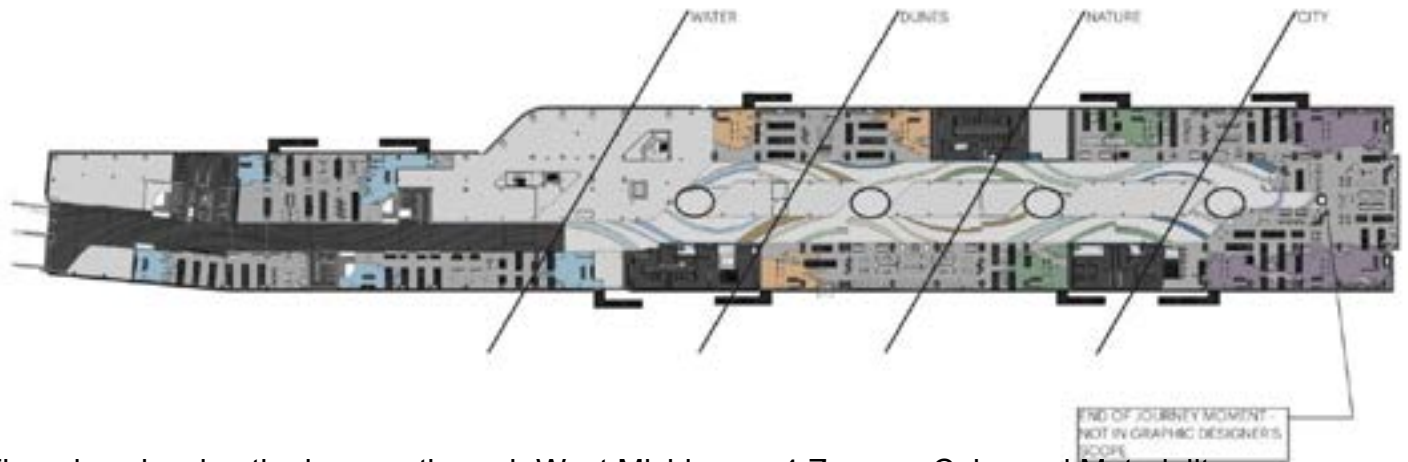
Floorplan showing the journey through West Michigan – 4 Zones – Color and Materiality