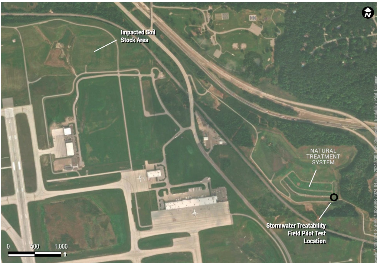
Figure 5. Airport Location for Transfer and Emptying of Gabions.