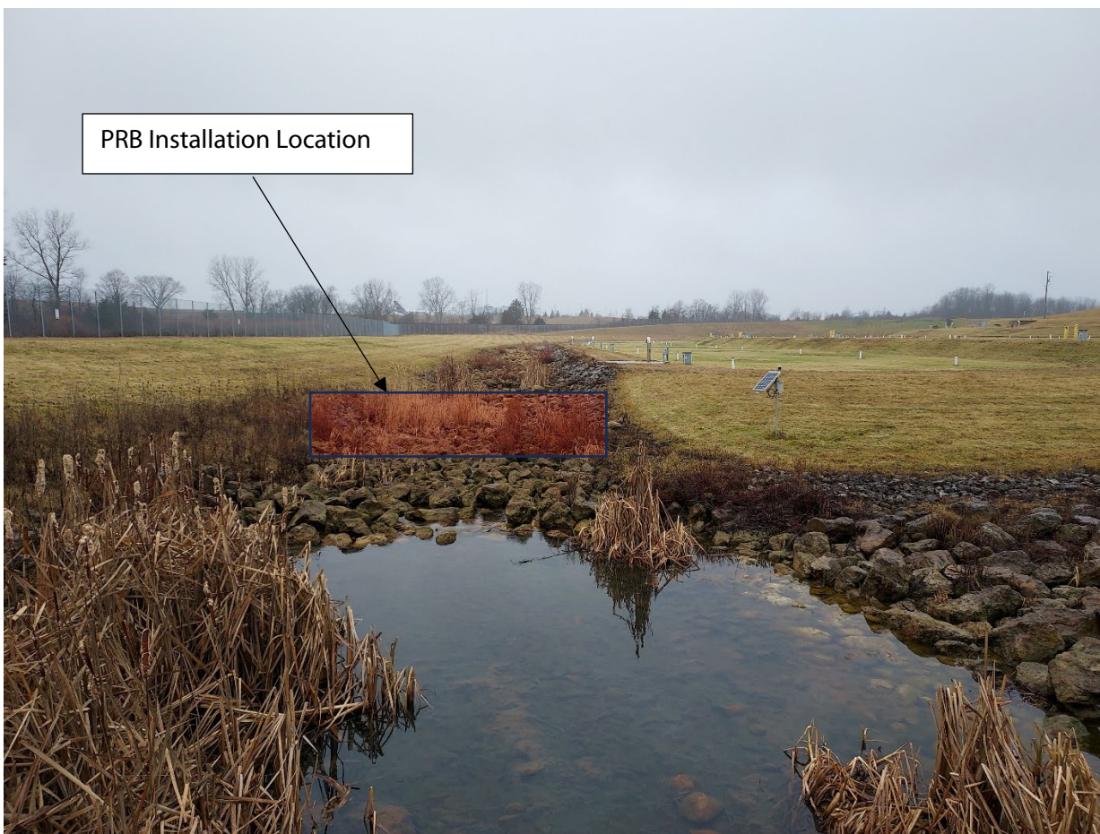
Figure 4. Drainage Channel and Location of PRB Placement.