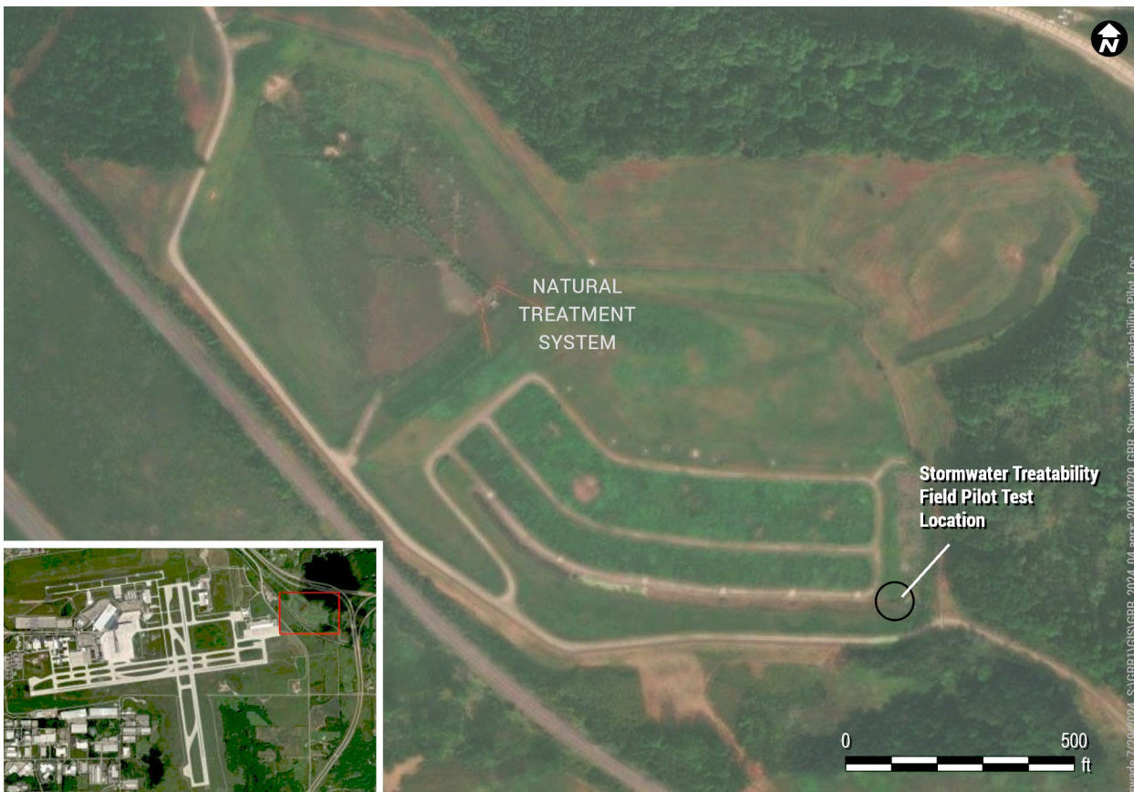
Figure 1. Location of Stormwater Treatability Field Pilot Test and PRB Installation.

The specific scope of work and elements to be included in the bid are as follows: