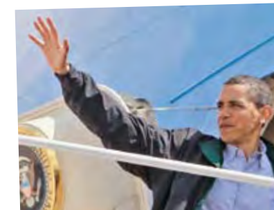
GFIA occasionally hosts landings by Air Force One. President Barack Obama visited West Michigan twice in 2010, using the Airport as a gateway to appearances in Kalamazoo and Holland.