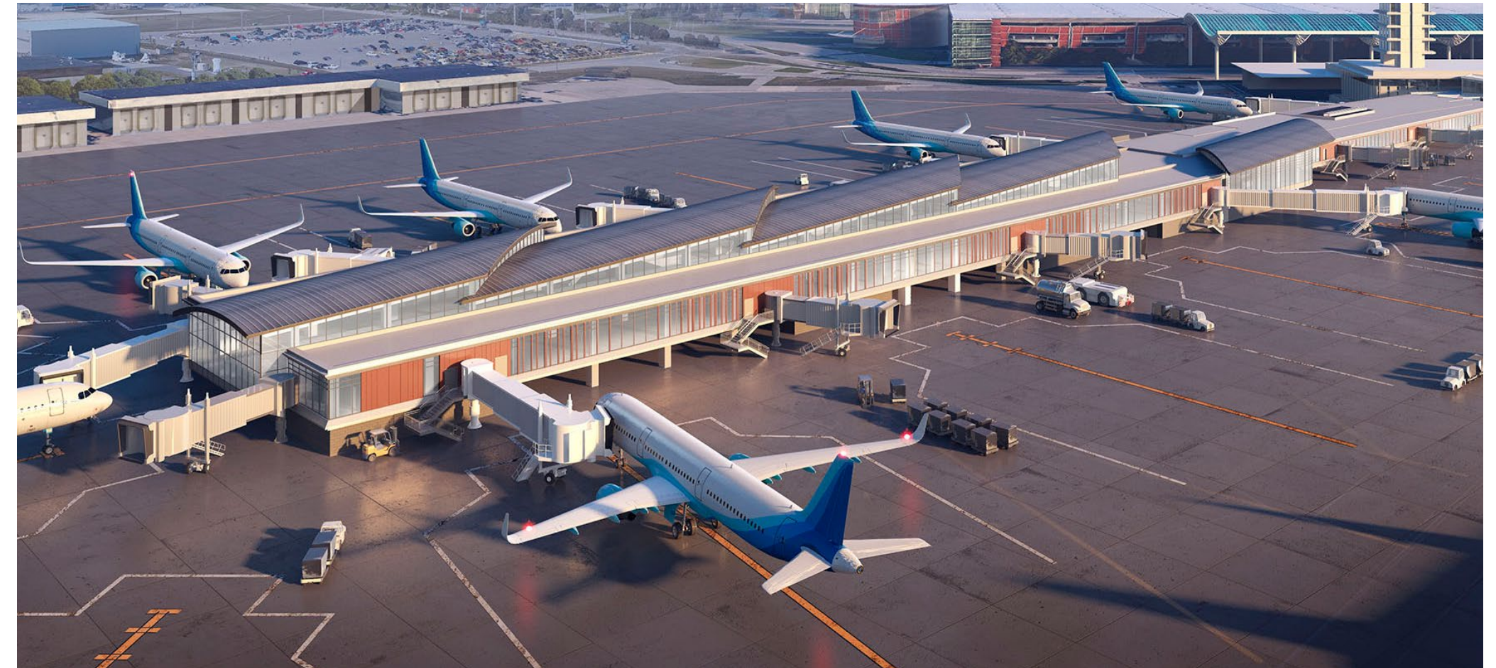
Rendering, Expanded Concourse A