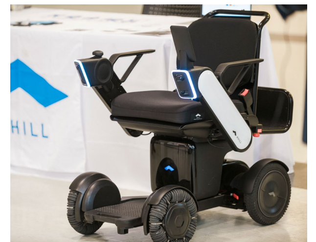
WHILL, Autonomous Mobility Device Company

FLITE has garnered international attention with companies from all over applying to the initiative to be considered for future rounds of funding. It has helped to support local Michigan-based companies, such as Dataspeed and Spotter ID, while simultaneously attracting global tech companies to the community to establish operations. FLITE will continue with a third and fourth round in 2023. ✈